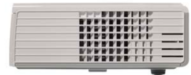
Right Side Profile